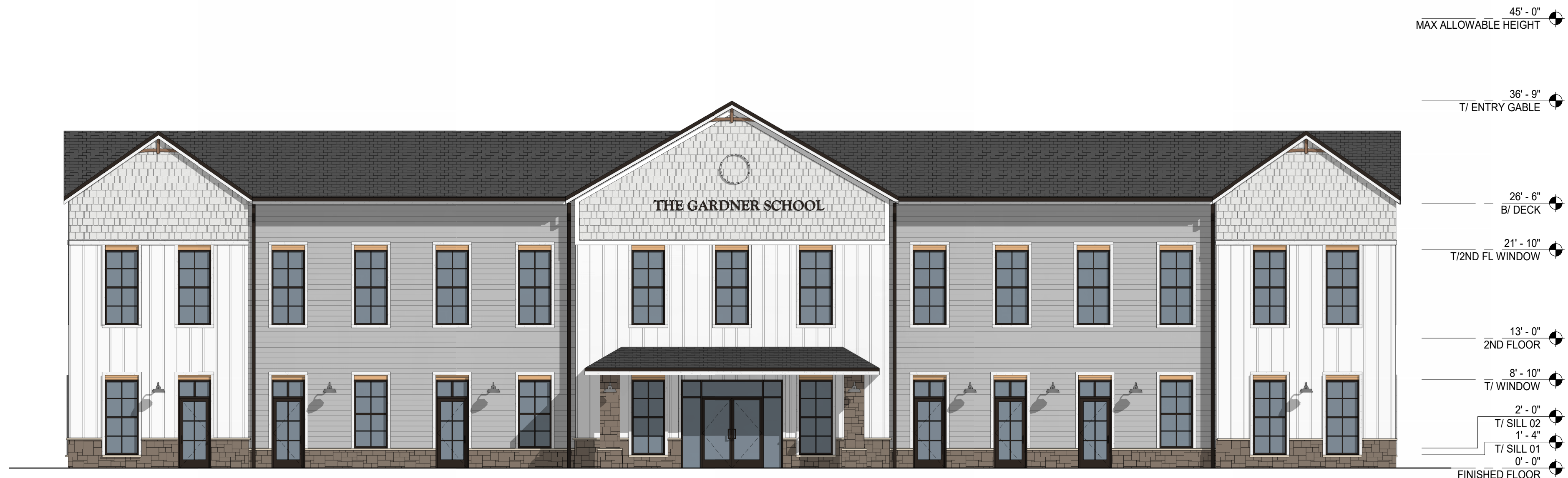
SCHEMATIC ELEVATION - SOUTH (MAIN ENTRY) SCALE: 1/8" = 1'-0"