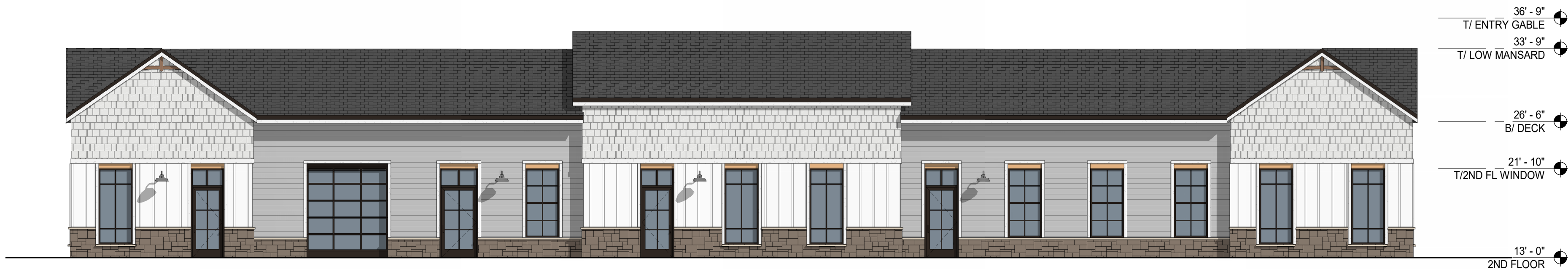
SCHEMATIC ELEVATION - NORTH (PLAYGROUND) SCALE: 1/8" = 1'-0"