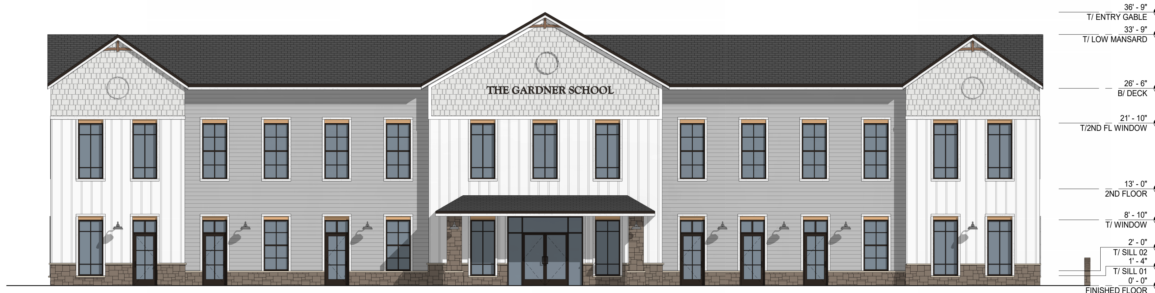
SCHEMATIC ELEVATION - SOUTH (MAIN ENTRY) SCALE: 1/8" = 1'-0"