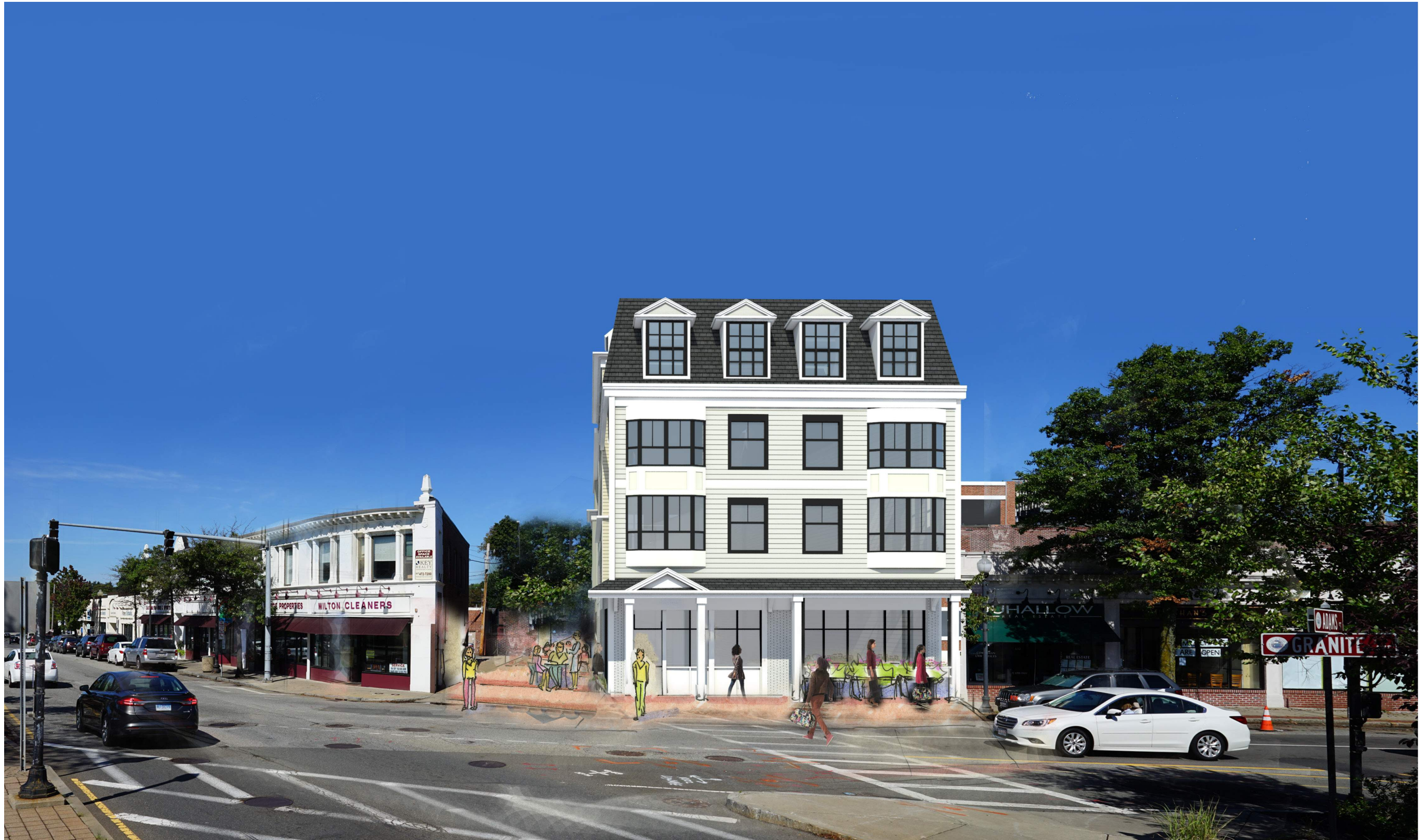
Falconi Mixed-Use Phase I

Milton, MA | June 21, 2018 | 17060