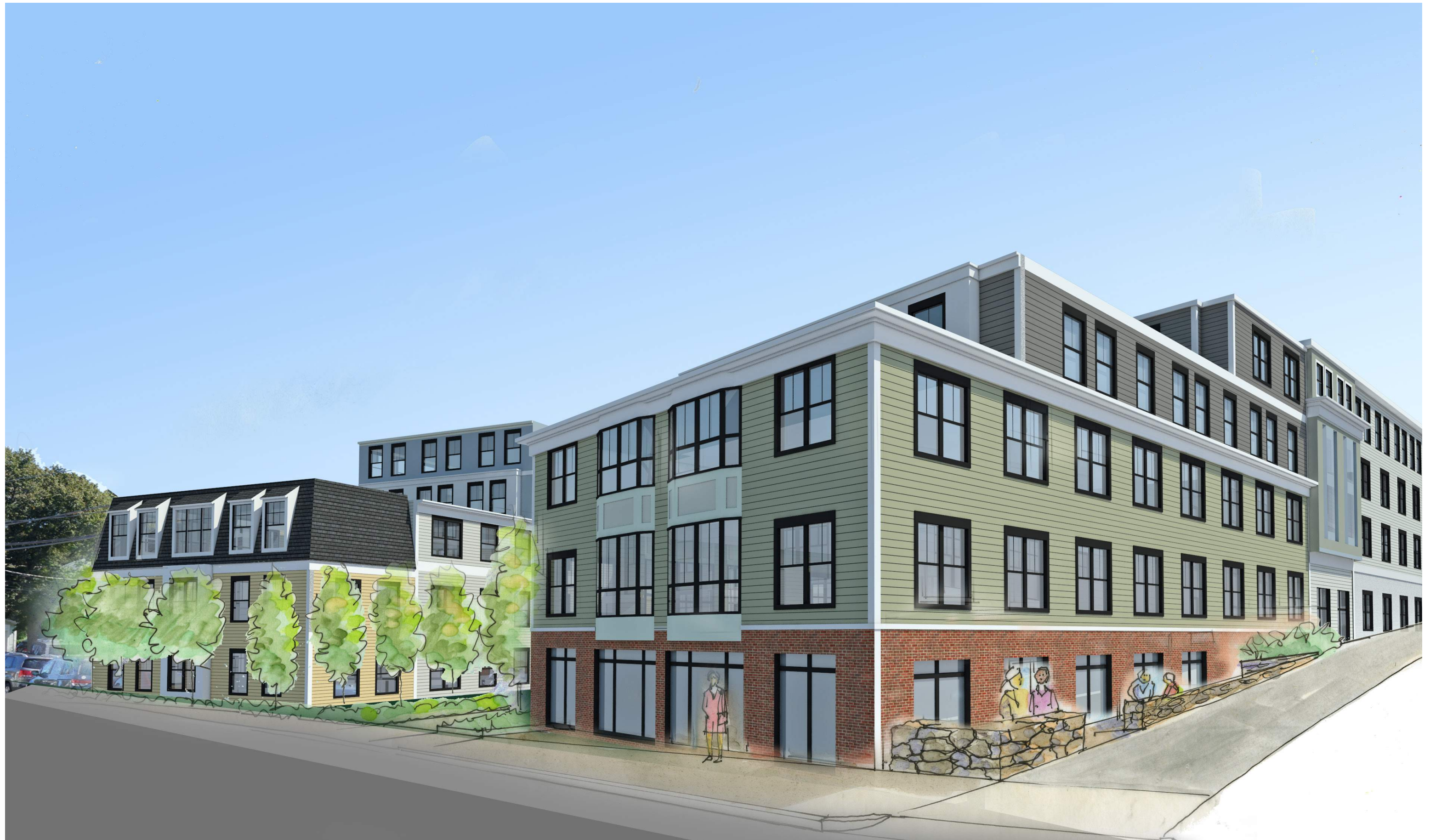
Falconi Mixed-Use Phase I

Milton, MA | June 21, 2018 | 17060