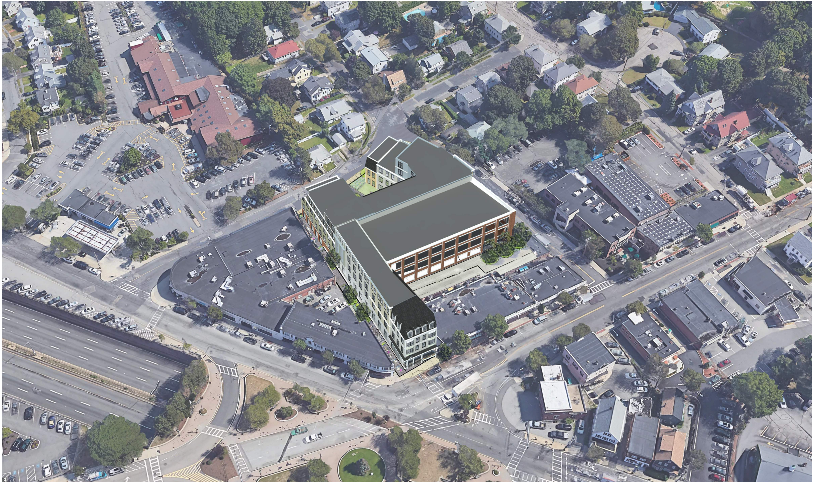
Falconi Mixed-Use Phase I

Milton, MA | June 21, 2018 | 17060