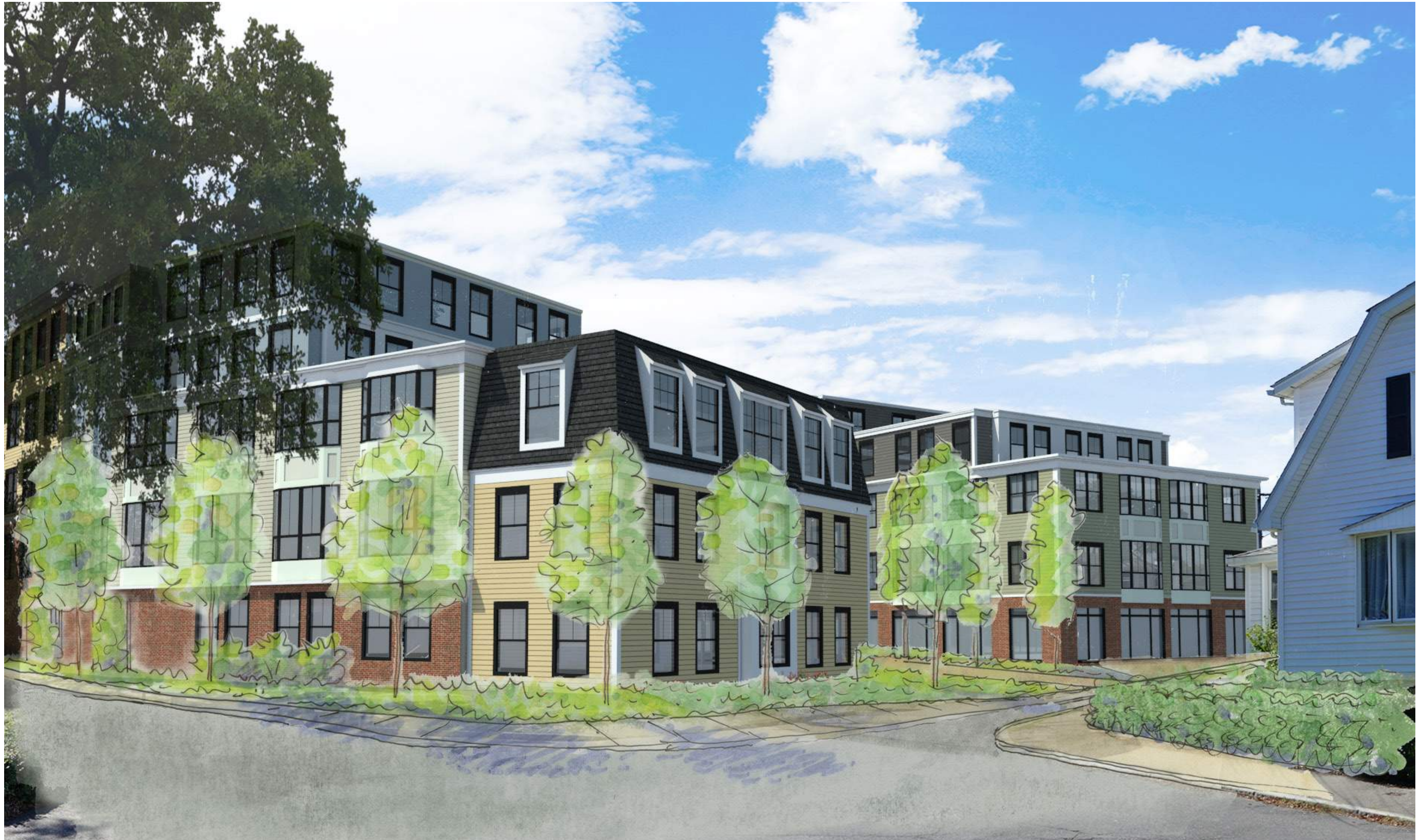
Falconi Mixed-Use Phase I

Milton, MA | June 21, 2018 | 17060