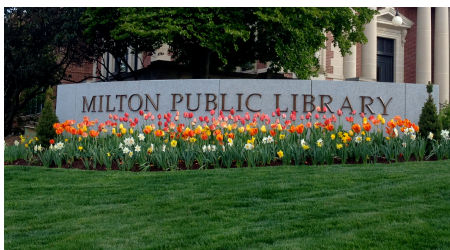
Bulbs planted by Milton Garden Club

The 350th committee is gearing up for a busy May and June and we want you to join us in the excitement. Hopefully you are noticing the many reminders around town about the upcoming activities: the 350th celebration flags flying from the lampposts in Central Avenue, Lower Mills and East Milton Square, the 350 tulips blooming outside the front of the library, and the newsletters now distributed to businesses each month. This month we hope you can join us at one of the many events including Mass Memories Road Show, historic photography exhibit at the Milton Public Library, Town Meeting and another terrific presentation "Milton's People and Places" by Anthony Sammarco. Save the dates of June 8th, 9th and 10th for fireworks, reunion activities, parade, and family fun event day with activities and band concert, and town-wide picnic and concert. Stay tuned for all the details, and don't forget to check out our website www.milton350thanniversary.org . We hope to see you at an event!