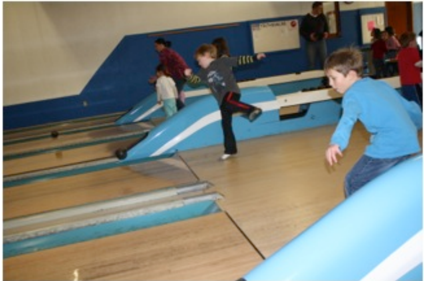
Bowlers at Cunningham Hall.