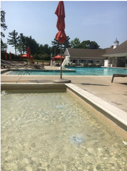
Wollaston Golf Club Pool

Environmental health activities are determined by legal mandate, complaints, licensure, permit requirements, inquiries and regulatory enforcement of local and state regulations. Activities include the licensing and inspections of food establishments, housing code inspections and enforcement actions, public and semi-public swimming pools, beaches, solid waste handling practices, animal, insect and rodent control, and the abatement of general nuisances. Additional concerns include asbestos removal, lead in the environment, hazardous waste and indoor air quality. The Health Director and Health Agent attended public health organization, state and national trainings this year on numerous environmental health topics.