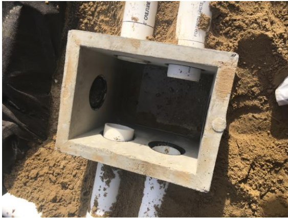
Distribution box inspection